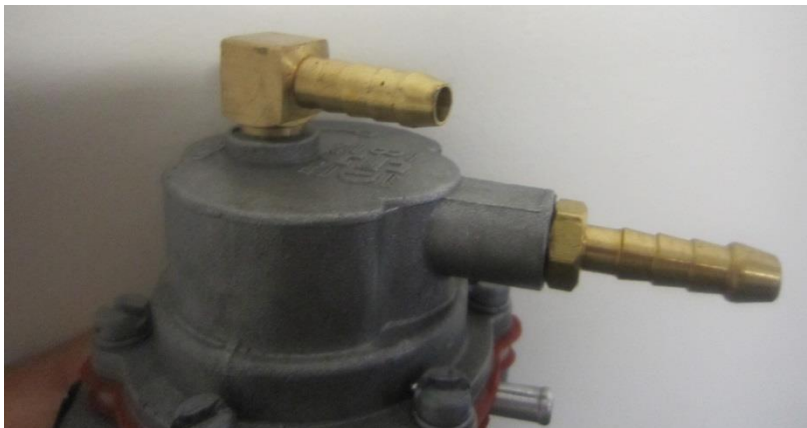
Figure 3: Pump with both fittings screwed in. (No further inspection required)